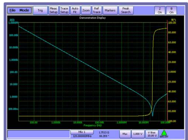
Simultaneous plot of impedance and phase displayed against frequency on a clear colour display

High precision measuring instruments can be damaged by All the models in the range incorporate protection against charged capacitors.